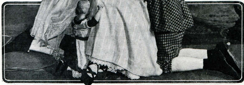
"On the first night of 'The Warrens of Virginia' little Mary was the most composed of the entire company. This is one of her great assets on the screen. She is all repose, easy and graceful at all times."

"Oh, is this Frances Starr?" ejaculated my little visitor, jumping up from where she had been sitting. "I have heard so much about you. Aren't you happy to be