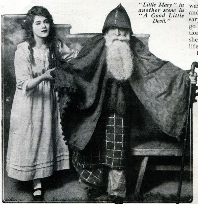
"Little Mary" in another scene in "A Good Little Devil."

was taken seriously ill, and it became necessary for her to undergo a dangerous operation. For many nights she lingered between life and death.